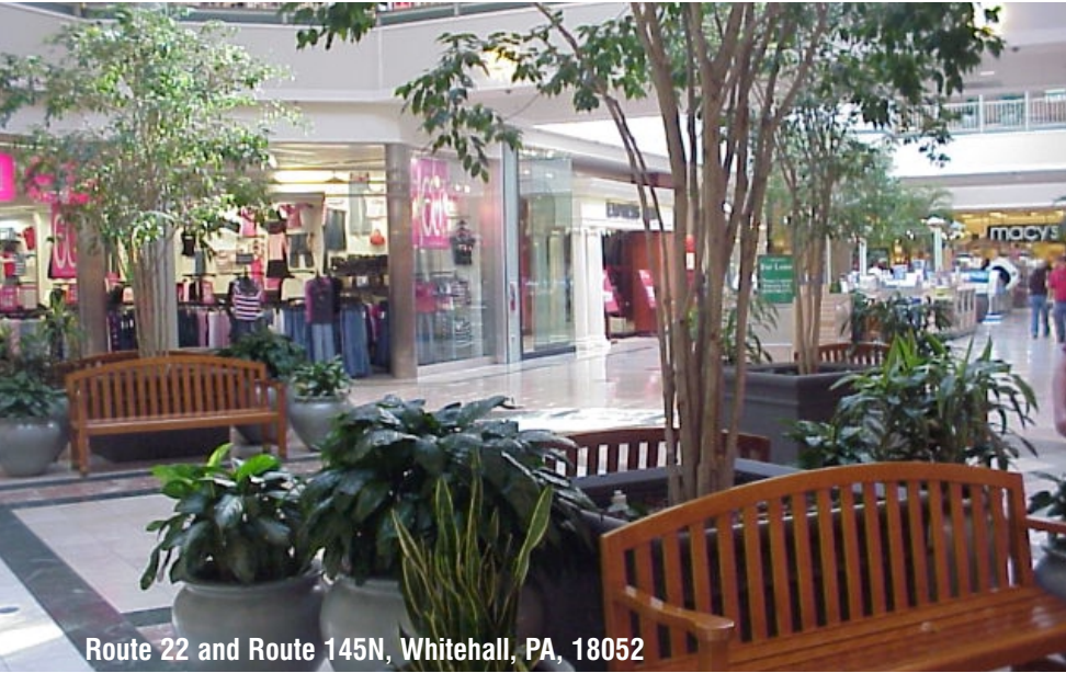
Route 22 and Route 145N, Whitehall, PA, 18052

Lehigh Valley Mall, located in Whitehall, Pennsylvania, features over 120 specialty stores and eateries and is anchored by JCPenney, Macy's, and Strawbridge's. The mall is conveniently located within the northeast quadrant of US Highway 22 (Lehigh Valley Thruway) and State Highway 145.