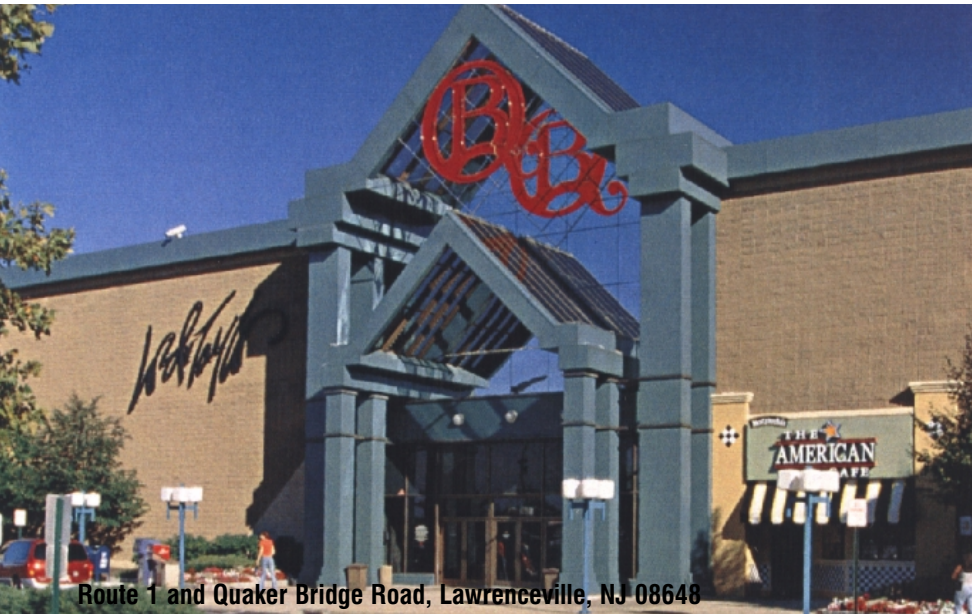
Route 1 and Quaker Bridge Road, Lawrenceville, NJ 08648

Quaker Bridge Mall is a 1.2 million square foot regional shopping center with Macy's, Lord & Taylor, Sears, and JCPenney and over 120 fine shops and restaurants. The center is located at the intersection of Route One and Quakerbridge Road in Lawrenceville, New Jersey and is conveniently located and easily accessible from all major roads.