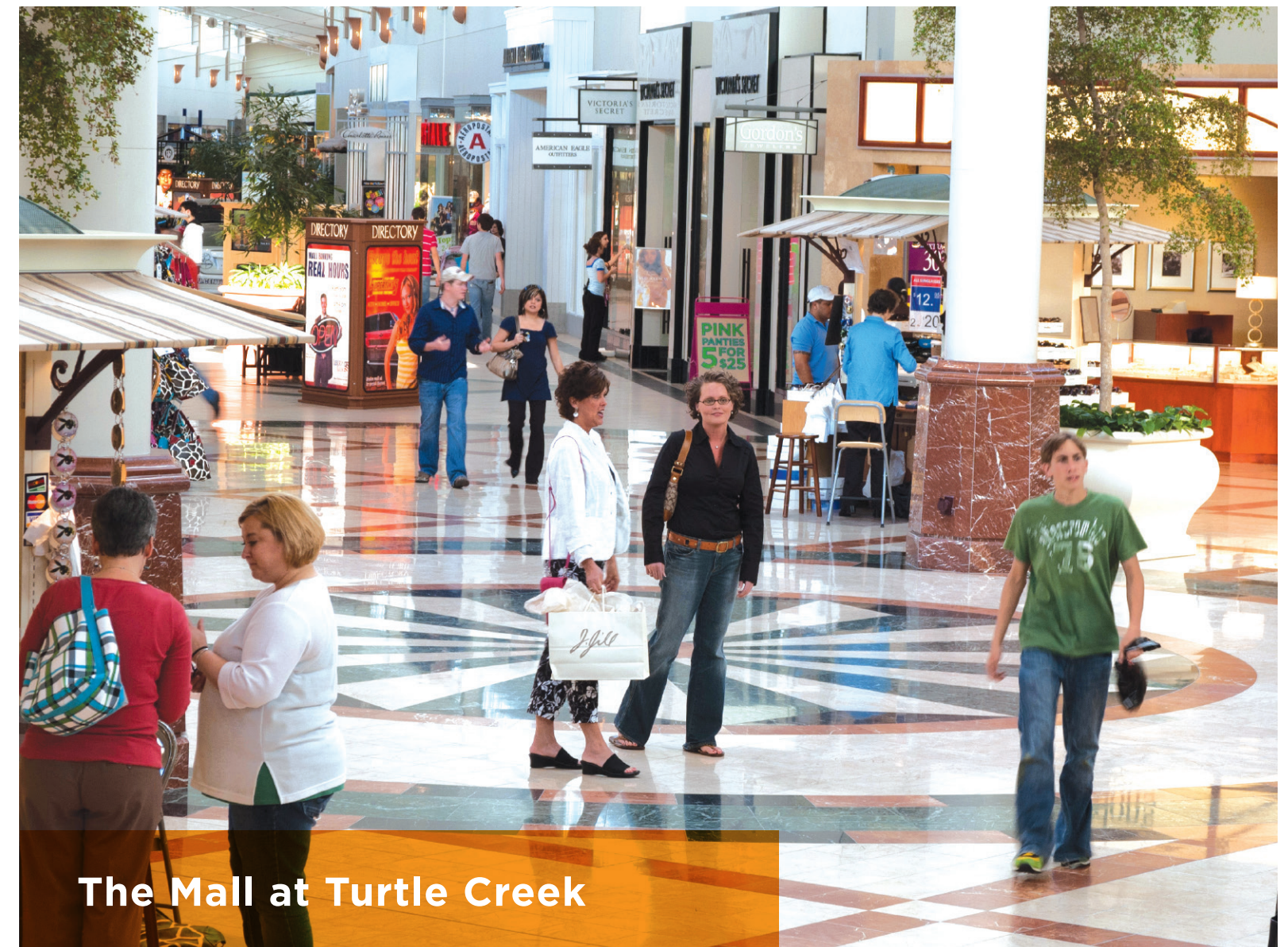
The Mall at Turtle Creek