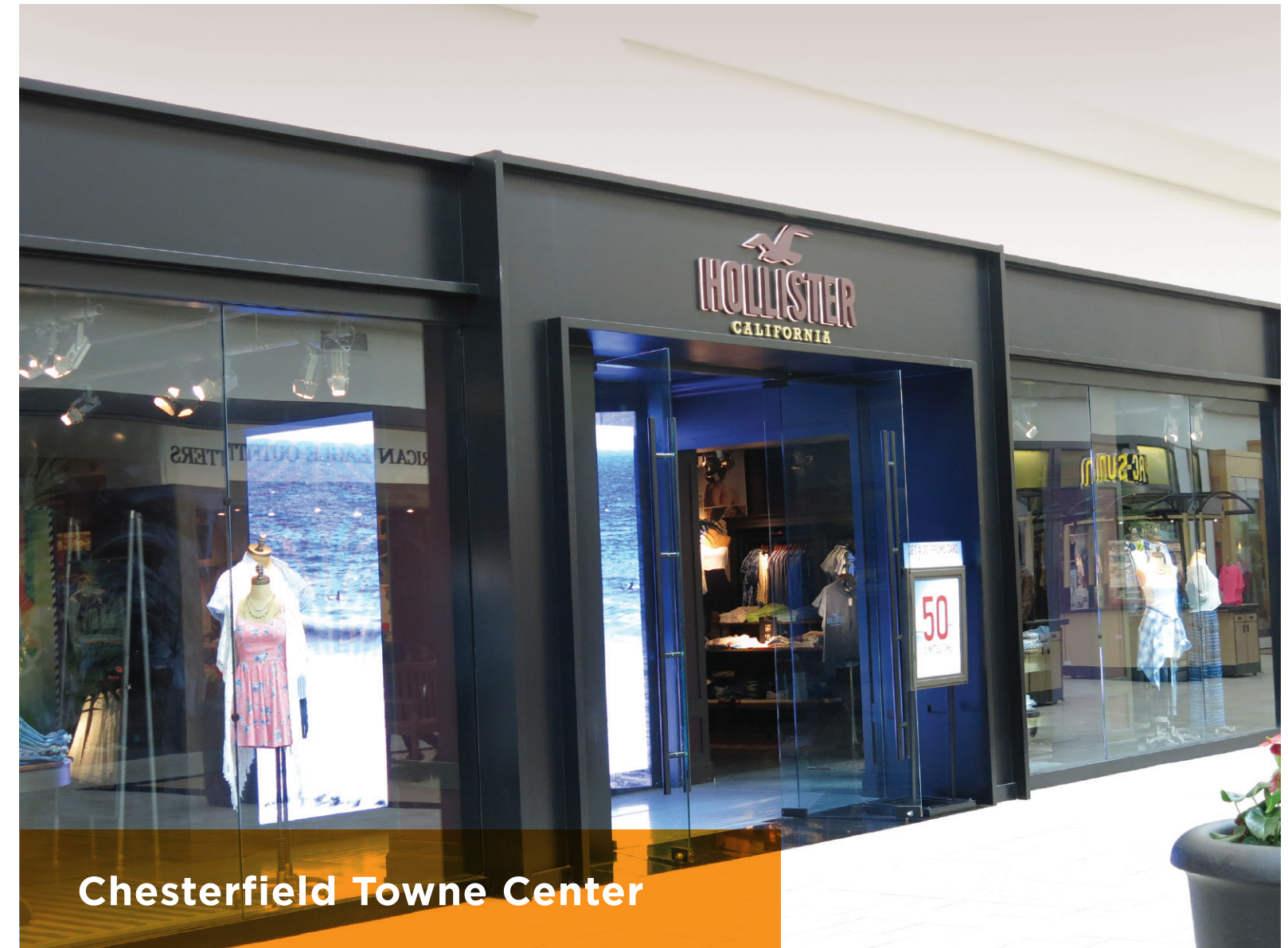
Chesterfield Towne Center