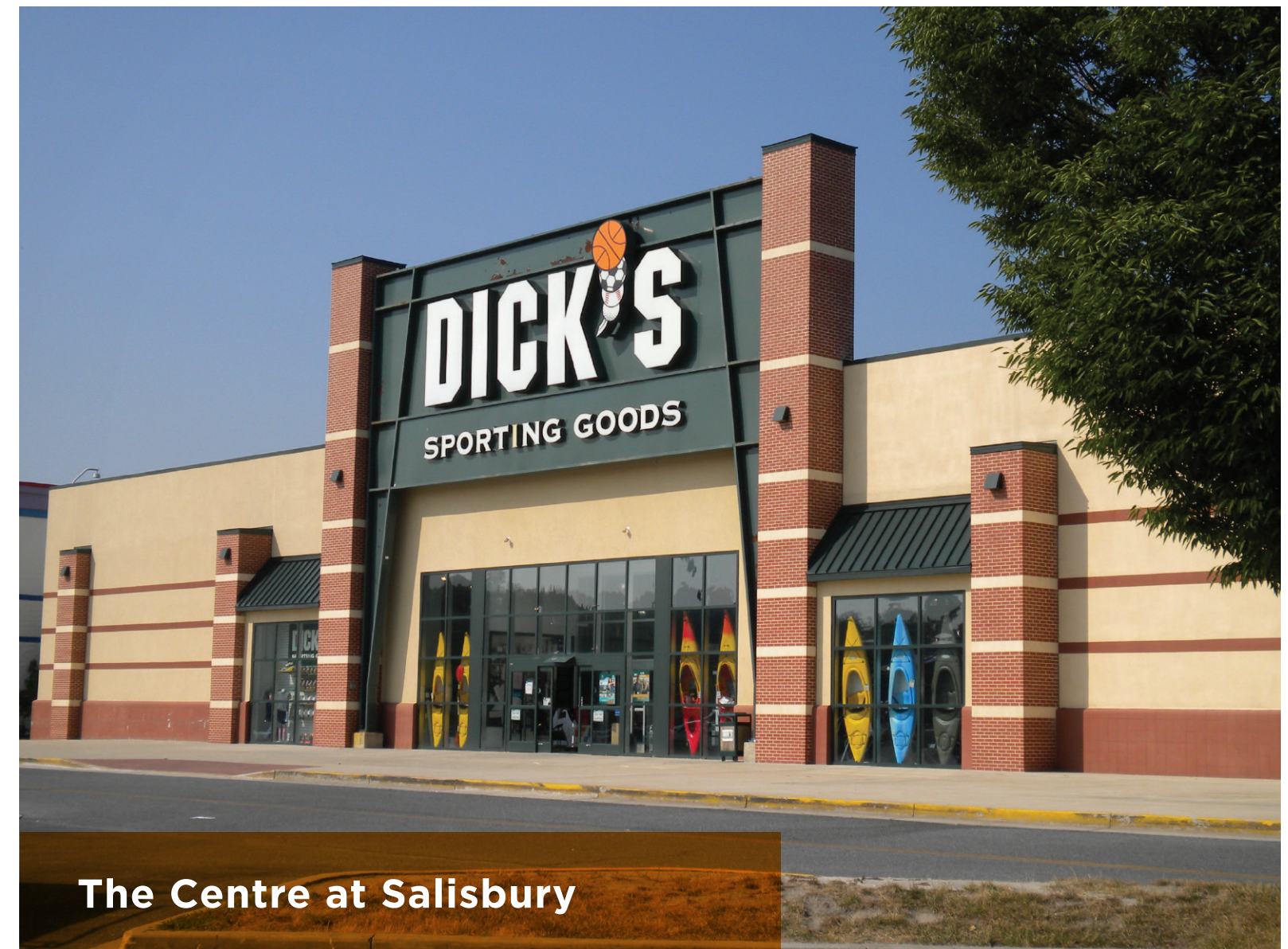
The Centre at Salisbury